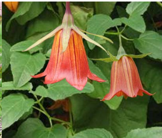
Canarina canariensis - 90c