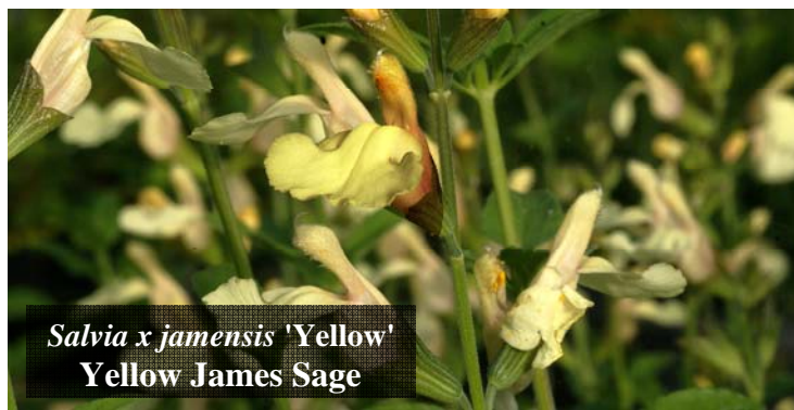
Salvia x jamensis 'Yellow' Yellow James Sage