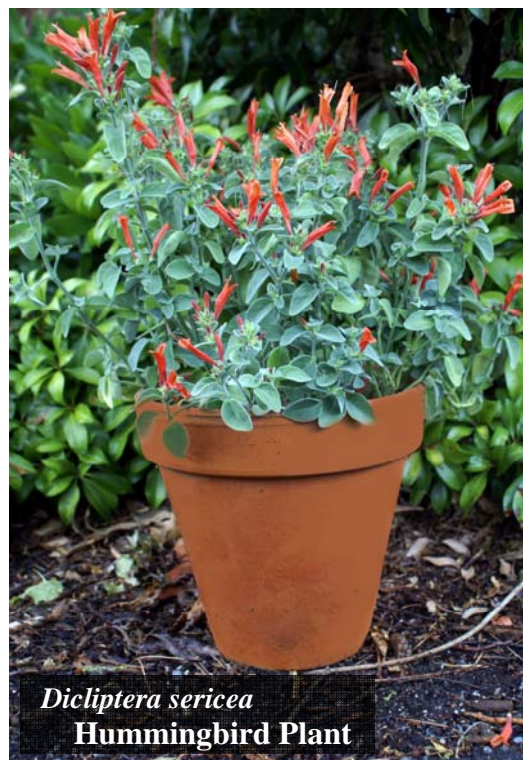
Dicliptera sericea Hummingbird Plant