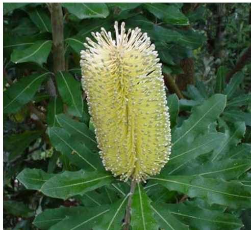
Banksia integrifolia - 90c