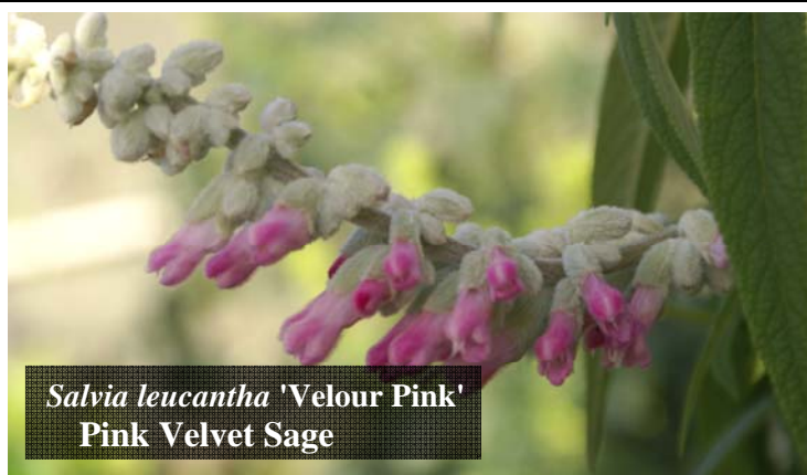
Salvia leucantha 'Velour Pink' Pink Velvet Sage