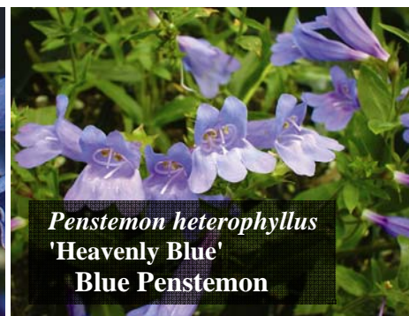
Penstemon heterophyllus 'Heavenly Blue' Blue Penstemon