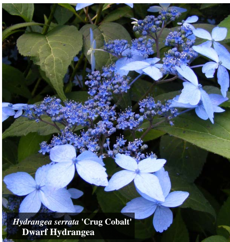
Hydrangea serrata 'Crug Cobalt' Dwarf Hydrangea