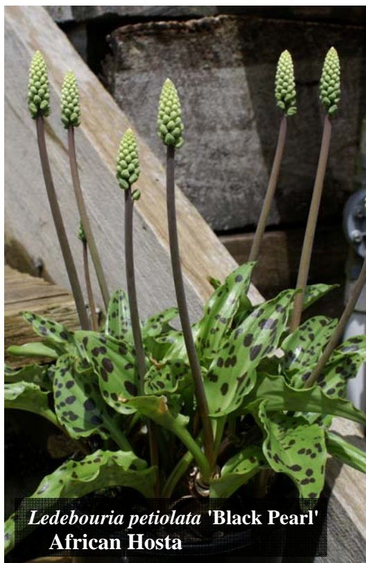
Ledebouria petiolata 'Black Pearl' African Hosta