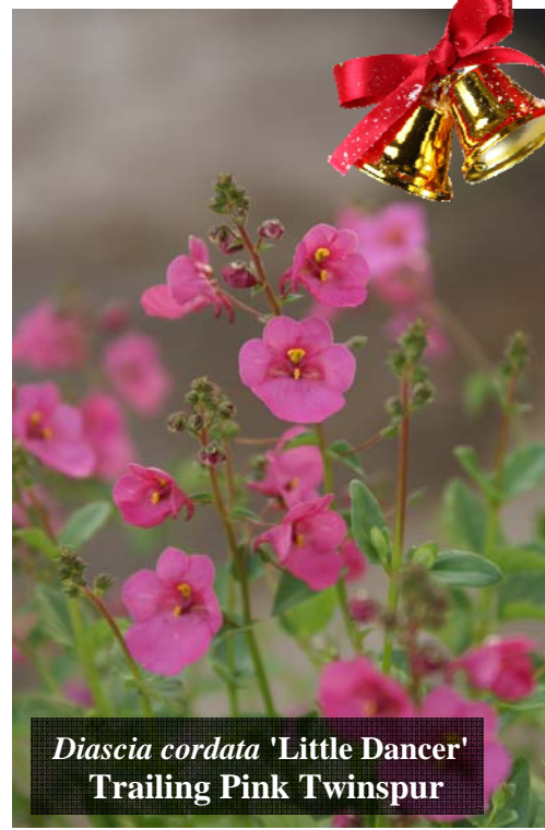
Diascia cordata 'Little Dancer' Trailing Pink Twinspur