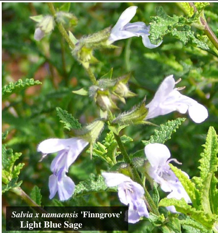
Salvia x namaensis 'Finn Grove' Light Blue Sage