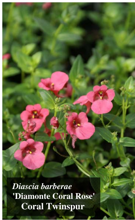
Diascia barberae 'Diamonte Coral Rose' Coral Twinspur