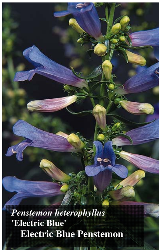
Penstemon heterophyllus 'Electric Blue' Electric Blue Penstemon