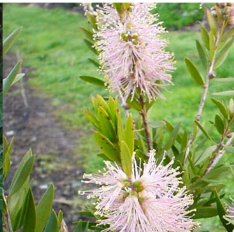
Callistemon salignus - 90c