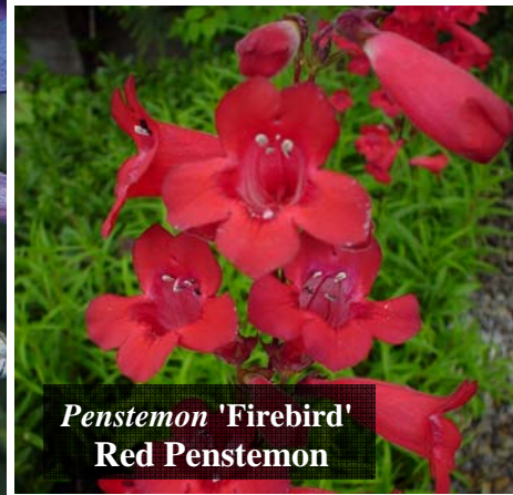
Penstemon 'Firebird' Red Penstemon