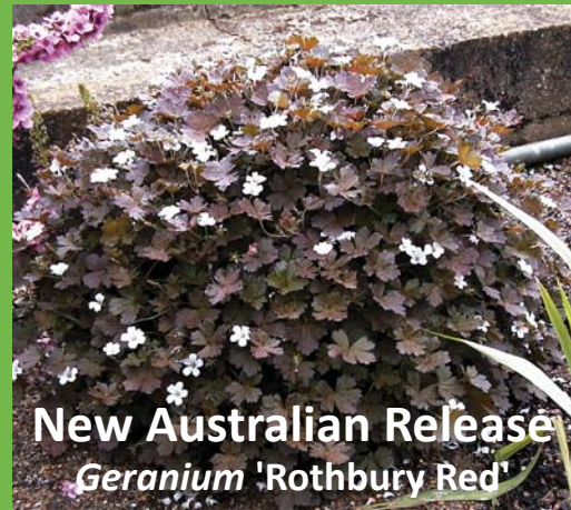
New Australian Release Geranium 'Rothbury Red'