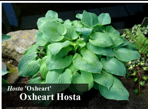
Hosta 'Oxheart' Oxheart Hosta