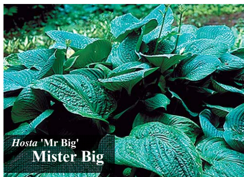
Hosta 'Mr Big' Mister Big