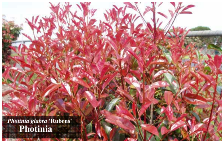
Photinia glabra 'Rubens' Photinia