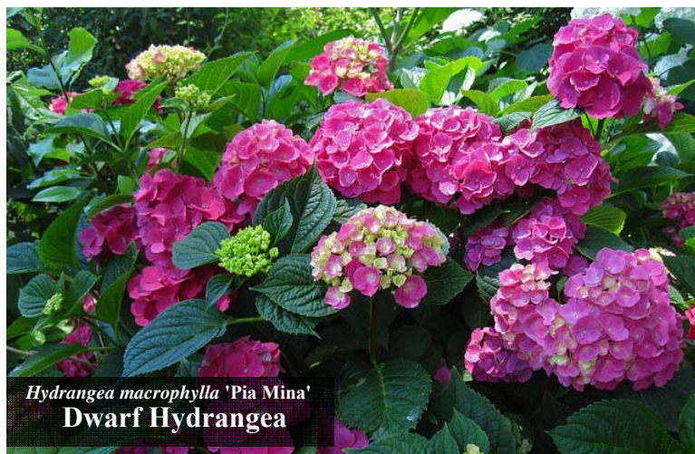
Hydrangea macrophylla 'Pia Mina' Dwarf Hydrangea