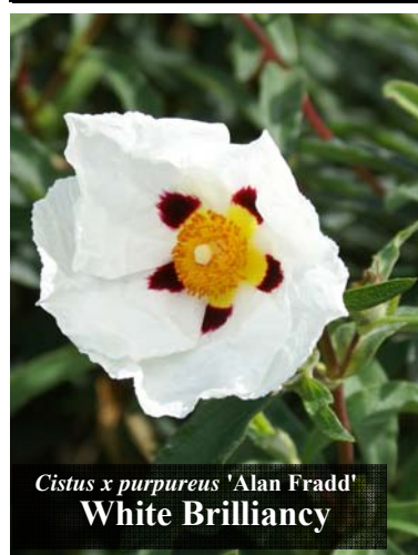
Cistus x purpureus 'Alan Fradd' White Brilliancy