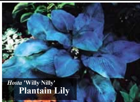
Hosta 'Willy Nilly' Plantain Lily