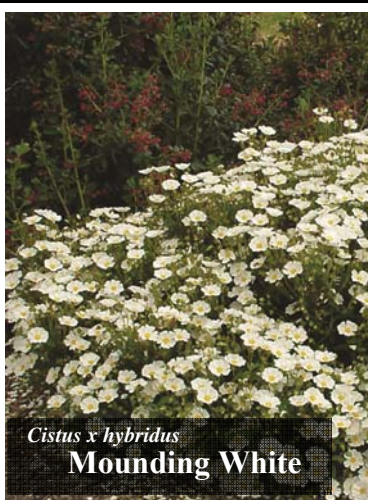
Cistus x hybridus Mounding White