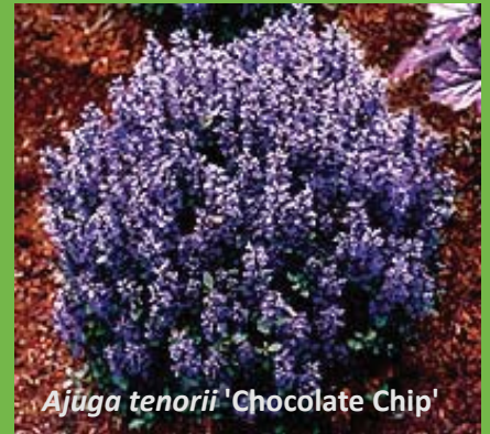
Ajuga tenorii 'Chocolate Chip'

Lophomyrtus 'Red Dragon' is an excellent yet quick growing hedge to around 1.5m. It has small round red/black leaves and will grow in full shade to full sun. It is tolerant of moderate frosts and a wide range of soil types. The foliage color varies during the year with the new growth being pinkish and the older leaves being a deep red. In the shade it has a greenish tinge and in the cold the color can be almost black. It has small cream flowers over the summer months.