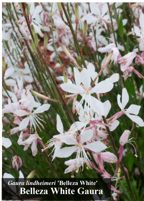
Gaura lindheimeri 'Belleza White' Belleza White Gaura