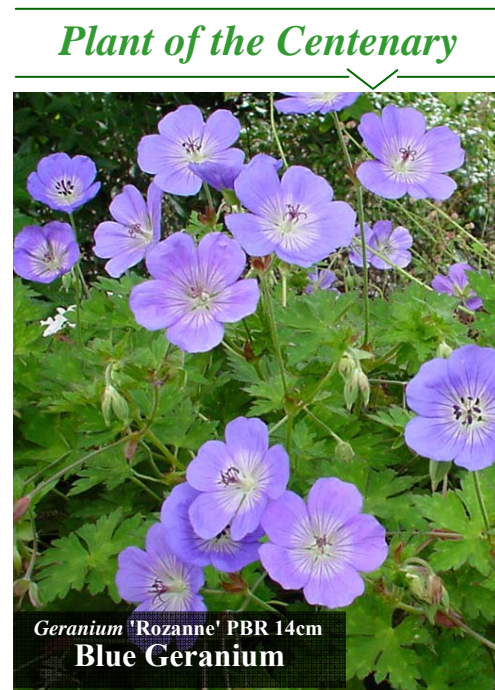
Geranium 'Rozanne' PBR 14cm Blue Geranium