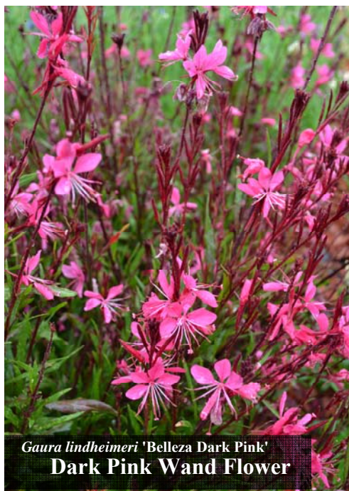
Gaura lindheimeri 'Belleza Dark Pink' Dark Pink Wand Flower