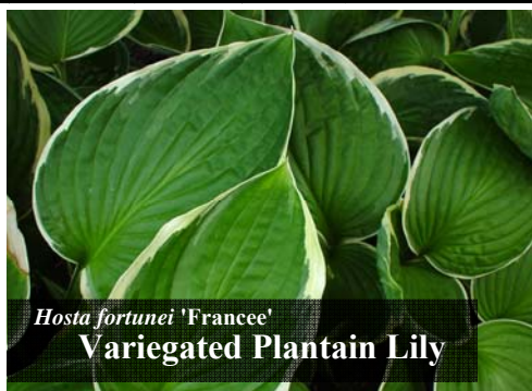
Hosta fortunei 'Francee' Variegated Plantain Lily