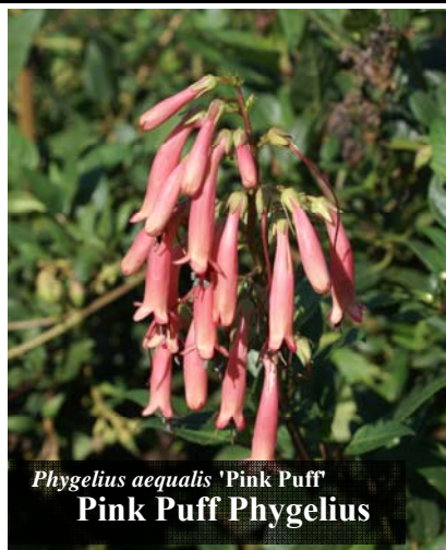
Phygelius aequalis 'Pink Puff' Pink Puff Phygelius