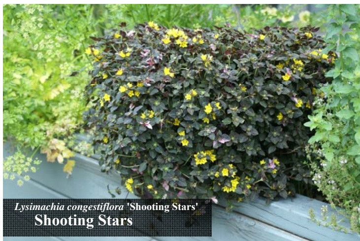
Lysimachia congestiflora 'Shooting Stars' Shooting Stars