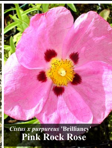
Cistus x purpureus 'Brilliancy' Pink Rock Rose