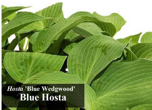
Hosta 'Blue Wedgwood' Blue Hosta