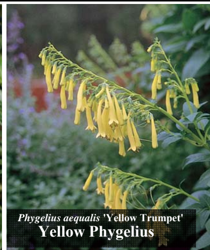
Phygelius aequalis 'Yellow Trumpet' Yellow Phygelius