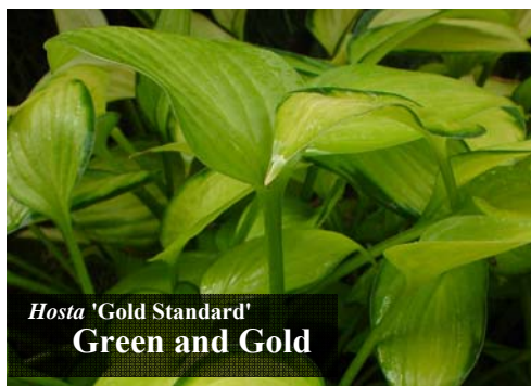
Hosta 'Gold Standard' Green and Gold