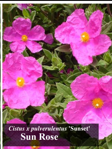
Cistus x pulverulentus 'Sunset' Sun Rose