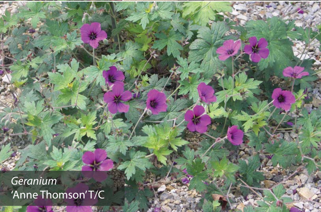
Geranium 'Anne Thomson' T/C