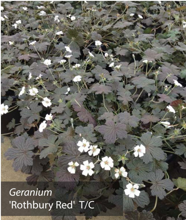
Geranium 'Rothbury Red' T/C