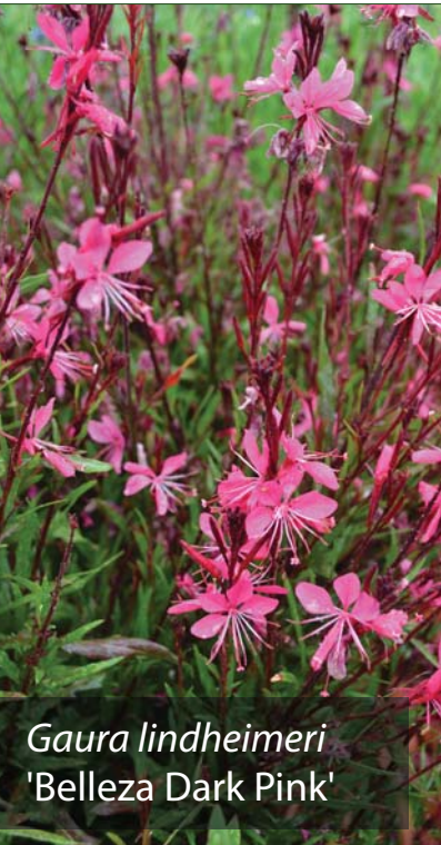
Gaura lindheimeri 'Belleza Dark Pink'