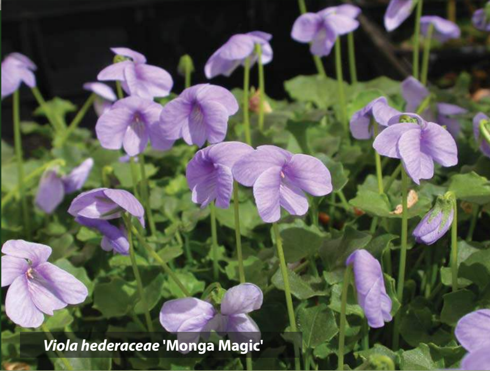
Viola hederaceae 'Monga Magic'