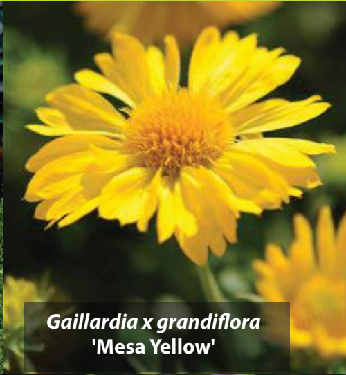
Gaillardia x grandiflora 'Mesa Yellow'