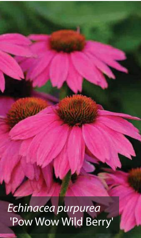
Echinacea purpurea 'Pow Wow Wild Berry'