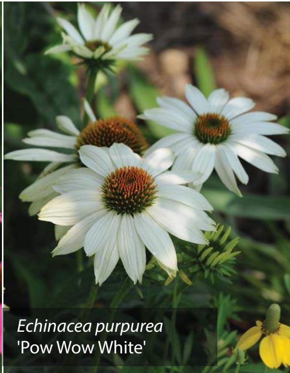
Echinacea purpurea 'Pow Wow White'