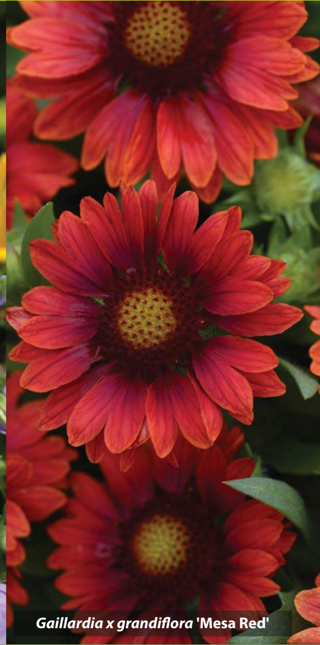
Gaillardia x grandiflora 'Mesa Red'