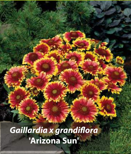
Gaillardia x grandiflora 'Arizona Sun'