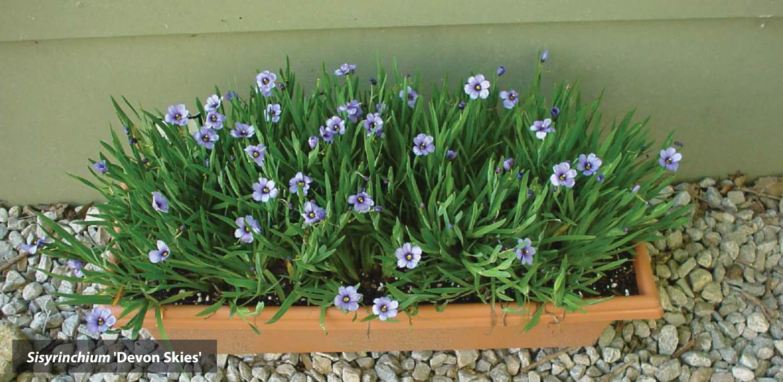
Sisyrrinchium 'Devon Skies'