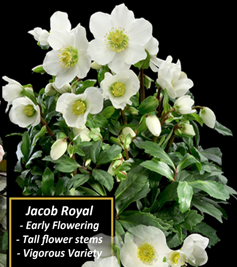
Jacob Royal - Early Flowering - Tall flower stems - Vigorous Variety