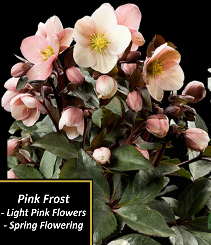
Pink Frost - Light Pink Flowers - Spring Flowering

All HGC varieties will flower in their first growing season. Ideal for quick sales turnover.