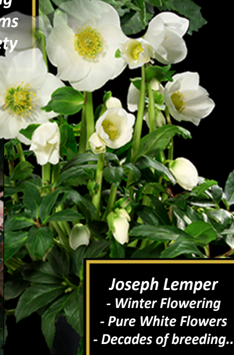
Joseph Lemper - Winter Flowering - Pure White Flowers - Decades of breeding..