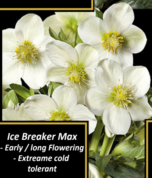
Ice Breaker Max - Early / long Flowering - Extreme cold tolerant