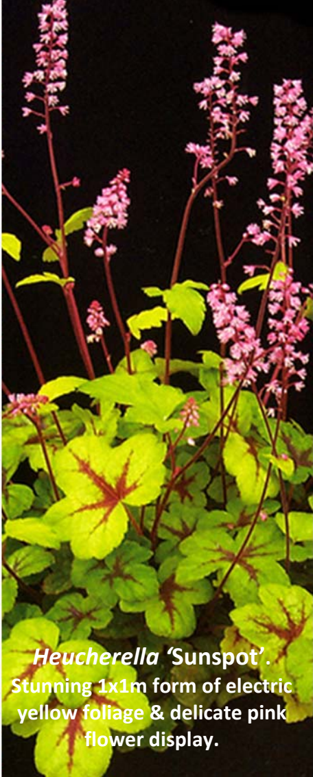
Heucherella 'Sunspot' . Stunning 1x1m form of electric yellow foliage & delicate pink flower display.