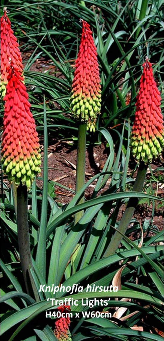
Kniphofia hirsuta 'Traffic Lights' H40cm x W60cm