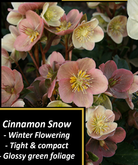
Cinnamon Snow - Winter Flowering - Tight & compact - Glossy green foliage