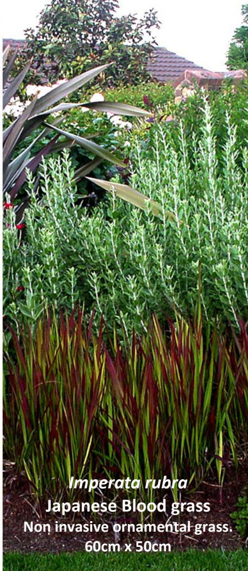
Imperata rubra Japanese Blood grass Non invasive ornamental grass. 60cm x 50cm